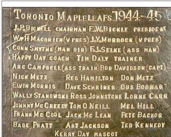
Inscribed on the Cup